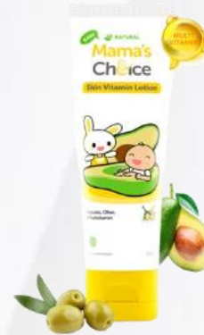
Baby Skin Vitamin Lotion