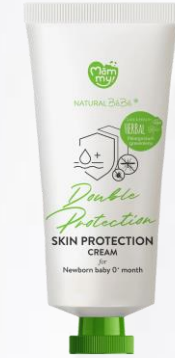
Skin Protection Cream (Mosquito repellent)