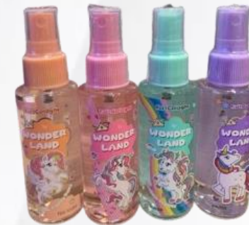
Wonderland Unicorn Kids Cologne

Miniso partnered with Meiyume to develop Wonderland Kids' Cologne, a collection of four safe and enchanting fragrances designed for children. Produced at Meiyume's Indonesia manufacturing plant, the colognes have vibrant, easy-to-hold bottles and scents tailored to spark joy and imagination.