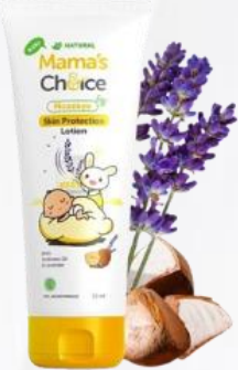
Mozzbye Skin Protection Lotion