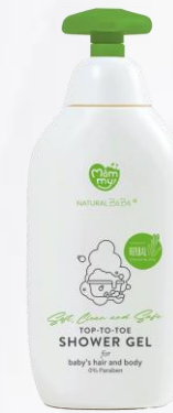
Top-to-toe Baby Shower Gel

Natural Béb , the beauty and personal care line under M mmy, partnered with Meiyume to create a high-quality, safe product range for newborns using natural ingredients. Utilizing our Indonesian manufacturing plant, Meiyume localized formulations to meet Southeast Asian preferences while adhering to strict European and Japanese standards, ensuring Natural B b 's commitment to safety and excellence for Vietnamese families.