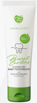
Fluoride Free Kids Toothpaste