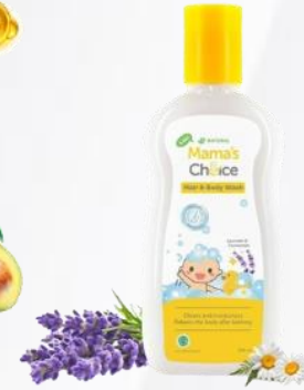
Hair and Body Wash