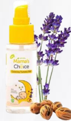
Calming Tummy Oil

Mama's Choice, part of The Parentinc, creates safe, halal-certified, natural products for mothers and babies in SEA. A top e-commerce brand and multi-award winner, Mama's Choice collaborated with Meiyume's Indonesian innovation team and manufacturing site to produce its Baby Series. Free from harmful chemicals, hypoallergenic, lab-tested in Singapore, and Halal-certified, the range ensures genuine safety for babies.